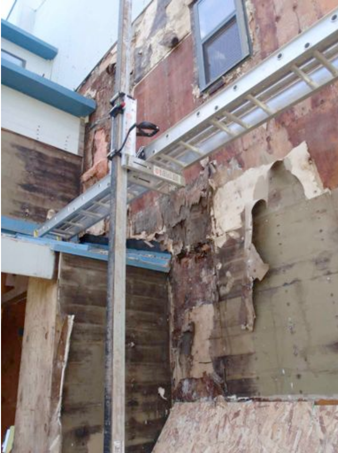
Fig 3: Siding removed with exterior drywall and sheathing exposed at unit 316.