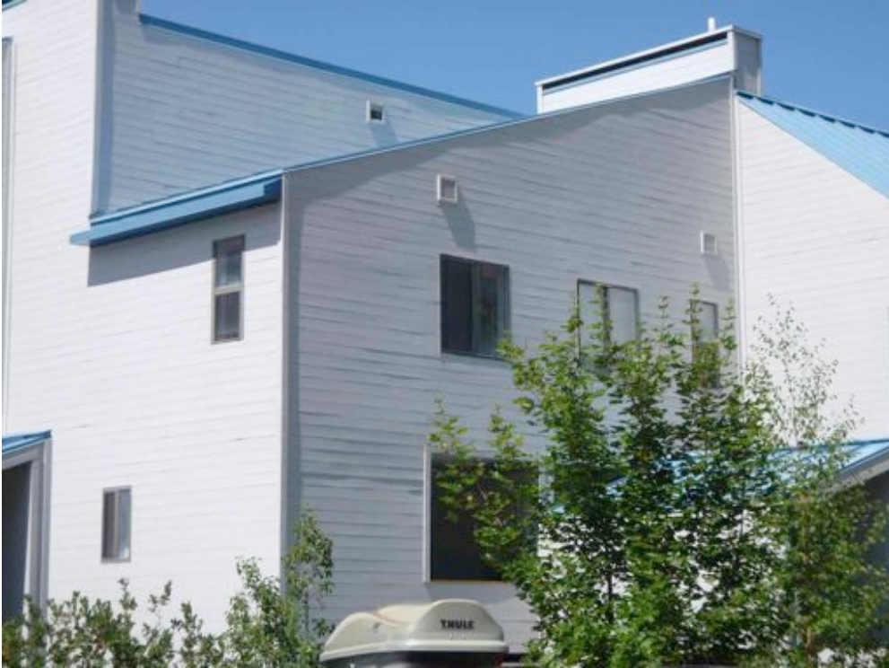
Fig 1: Typical exterior condition.