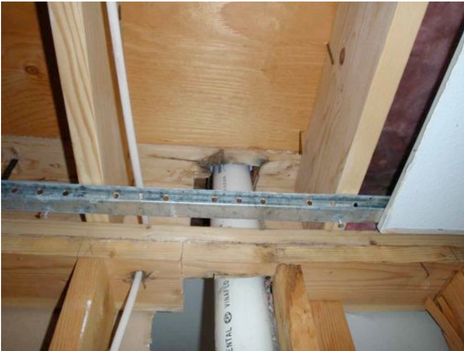
Fig: 4 Internal drain from above in unit 314/316 common wall. Source of leak.