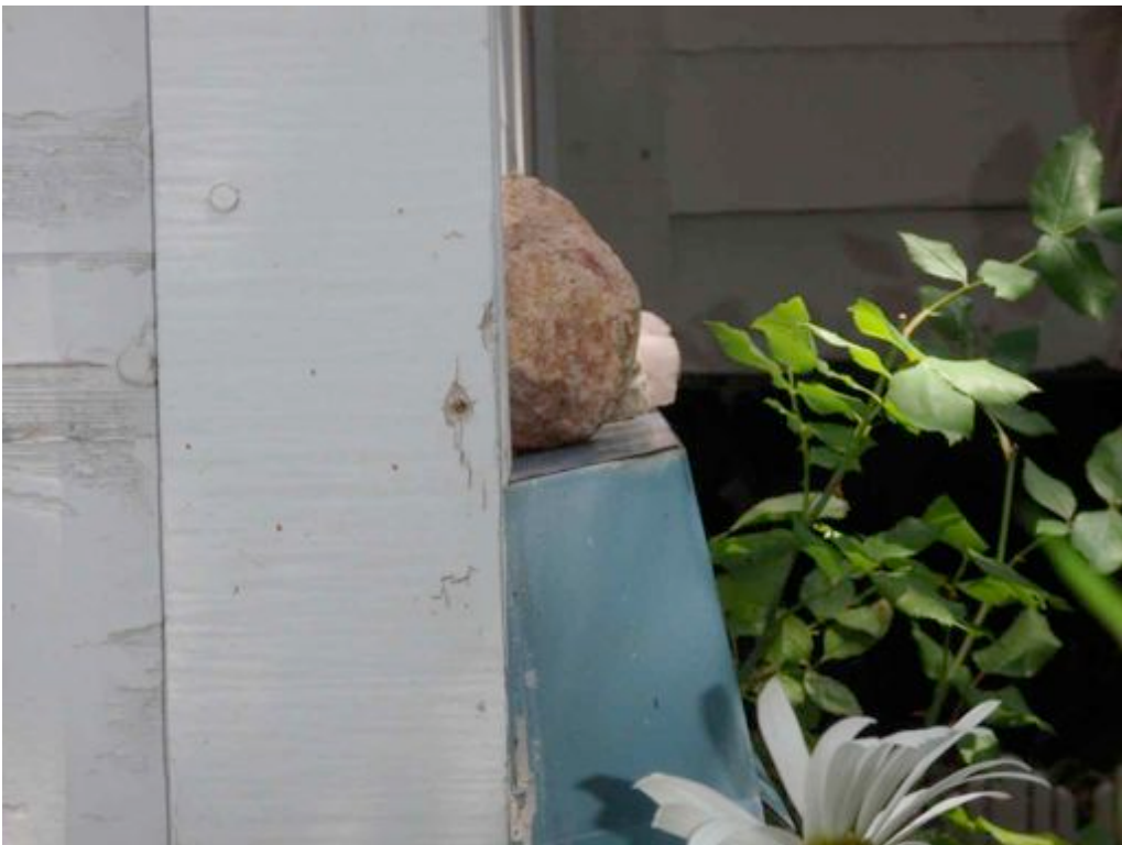
Fig 10: Typical flashing detail. Note how the flashing tips towards the wall rather than away. This is a result of faulty installation and/or the sill plate behind compressing.