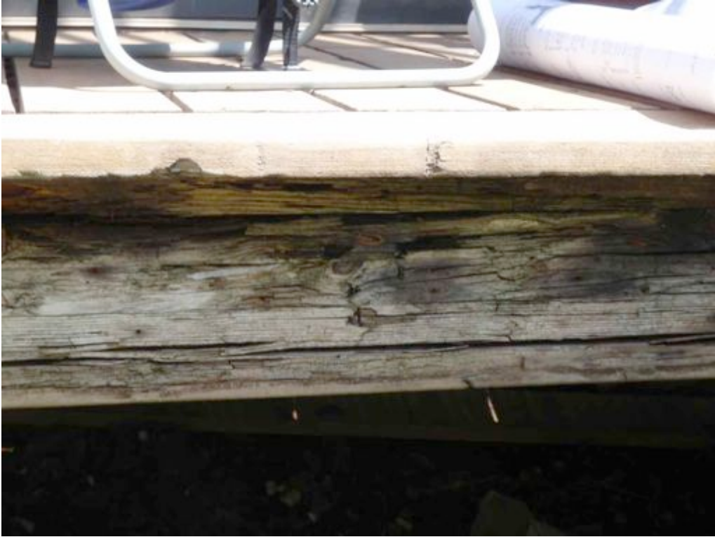
Fig 9: Typical porch edge beam.