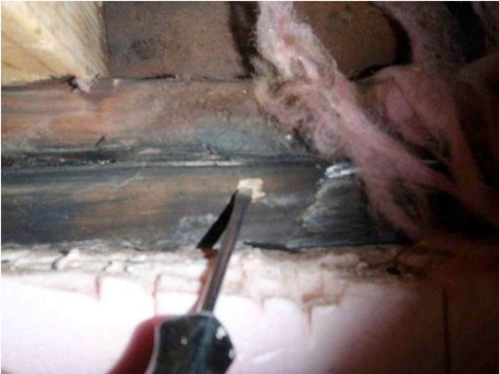
Fig 6: Sill plate in crawl below unit 314.