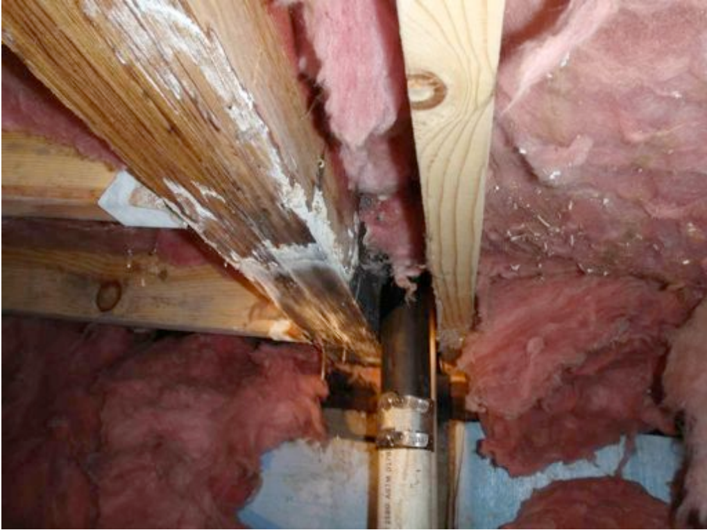
Fig 7: LVL beam showing multiple types of fungus. This photo was taken in the crawlspace, east of unit 316.