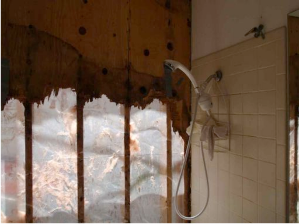
Fig 5: Moisture damage at showed enclosure in unit 314.