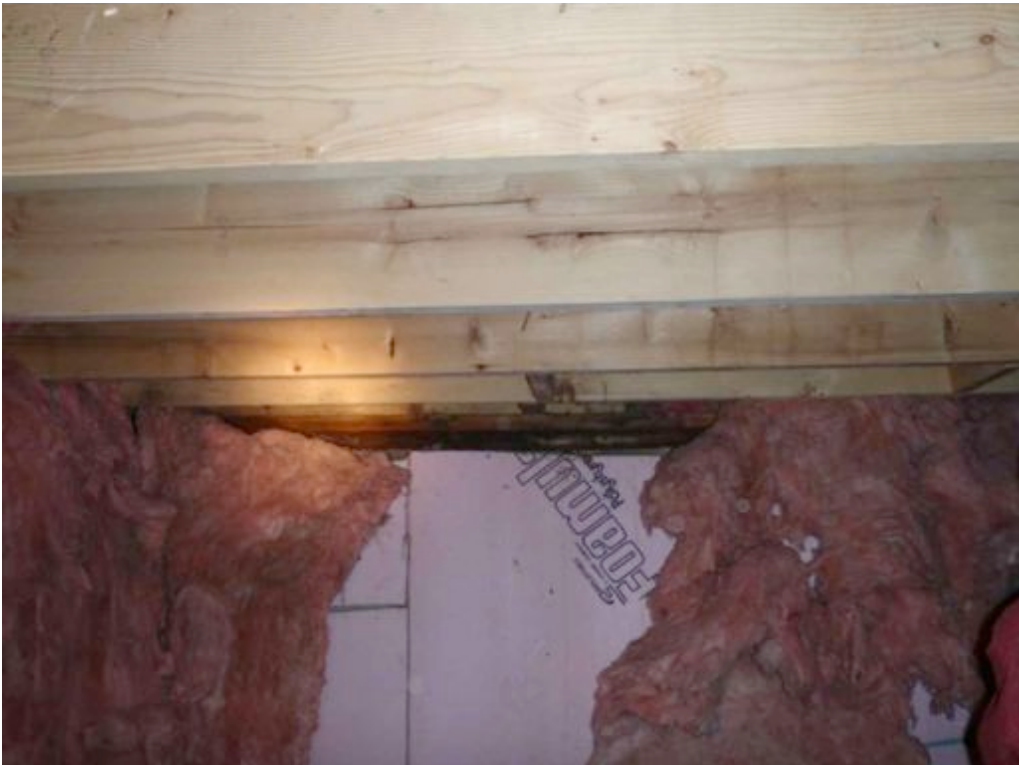
Fig 8: Typical sill plate damage in crawlspace.